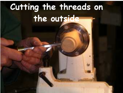
Cutting the threads on the outside