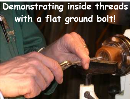
Demonstrating inside threads with a flat ground bolt!