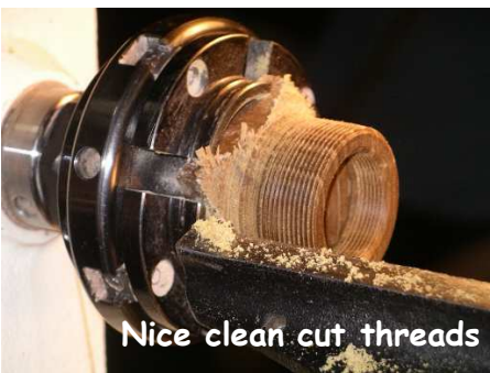
Nice clean cut threads