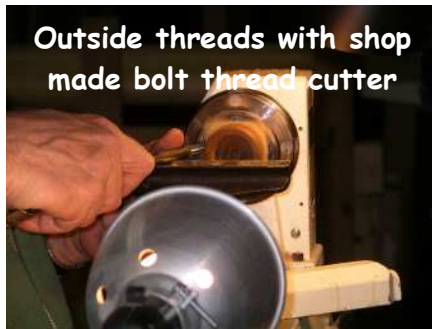
Outside threads with shop made bolt thread cutter