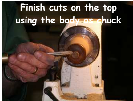
Finish cuts on the top using the body as chuck