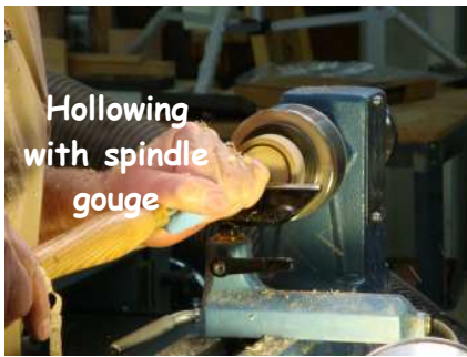
Hollowing with spindle gouge