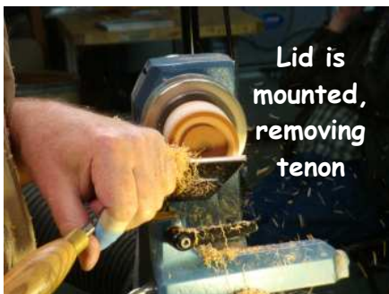
Lid is mounted, removing tenon