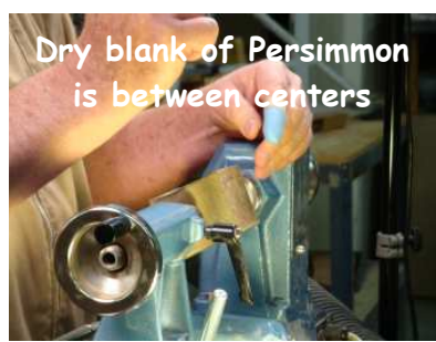
Dry blank of Persimmon is between centers