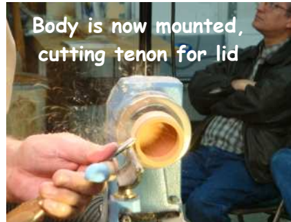
Body is now mounted, cutting tenon for lid