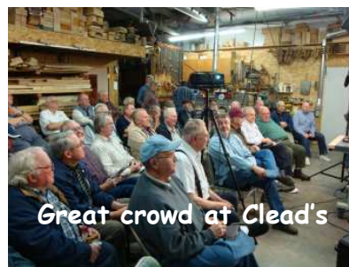
Great crowd at Clead's