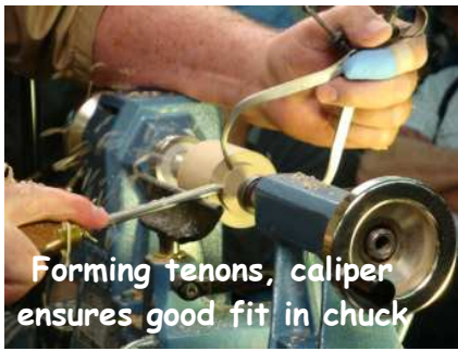
Forming tenons, caliper ensures good fit in chuck