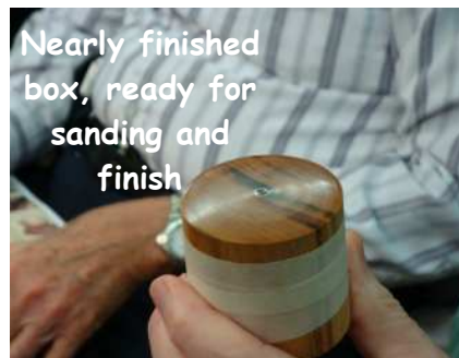
Nearly finished box, ready for sanding and finish