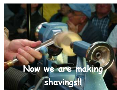
Now we are making shavings!!