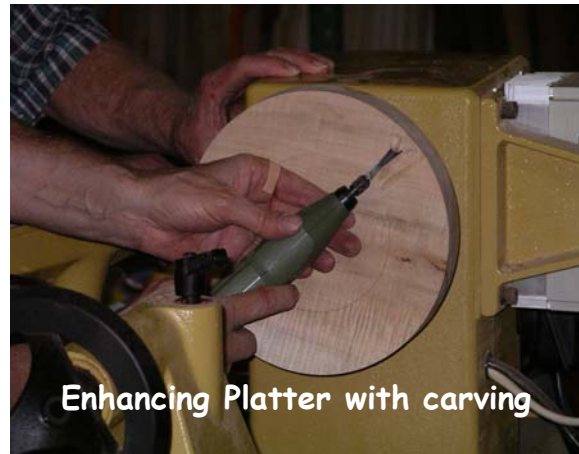
Enhancing Platter with carving

Oct ( for Nov meeting ) Platter with Inlay