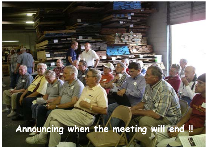
Announcing when the meeting will end !!