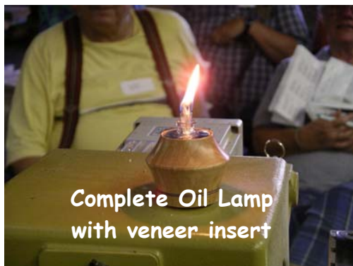
Complete Oil Lamp with veneer insert