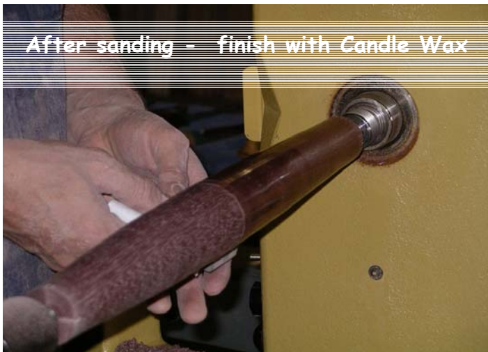
After sanding finish with Candle Wax