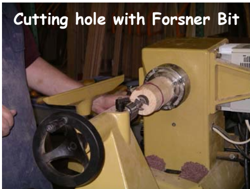
Cutting hole with Forsner Bit