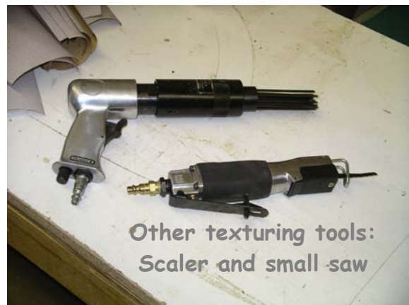
Other texturing tools: Scaler and small saw