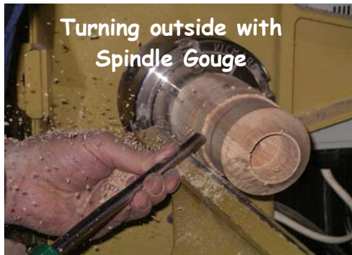
Turning outside with Spindle Gouge