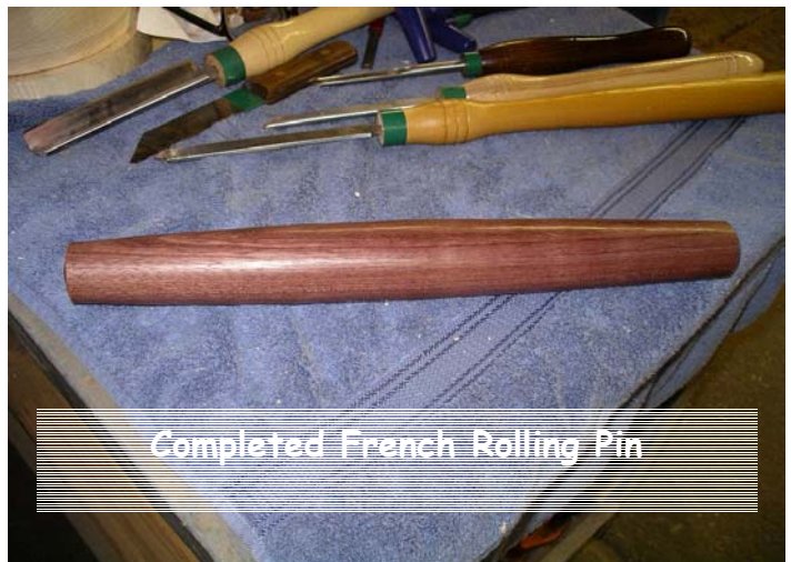
Completed French Rolling Pin