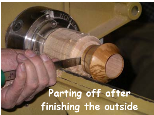
Parting off after finishing the outside