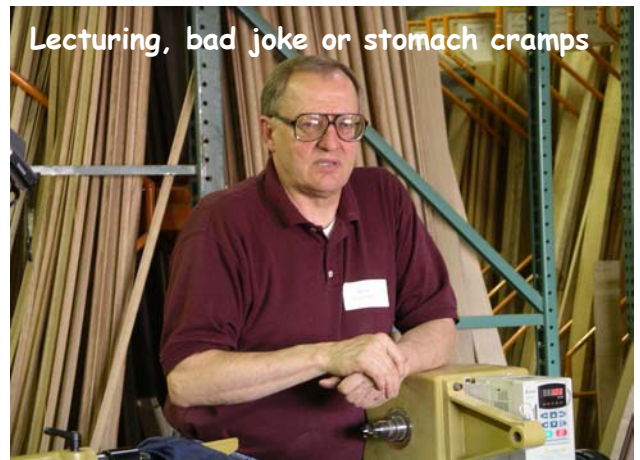
Lecturing, bad joke or stomach cramps