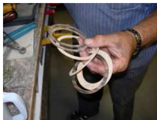
Dave cuts rings from turnings to use as inlays in future projects