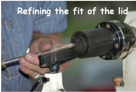
Refining the fit of the lid