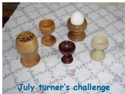
July turner's challenge