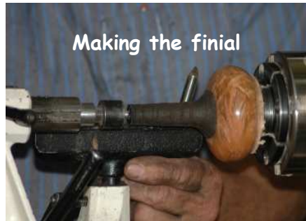
Making the finial