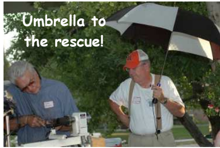
Umbrella to the rescue!