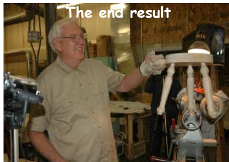
The end result