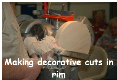
Making decorative cuts in rim