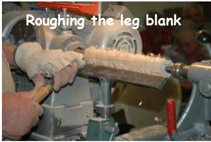
Roughing the leg blank