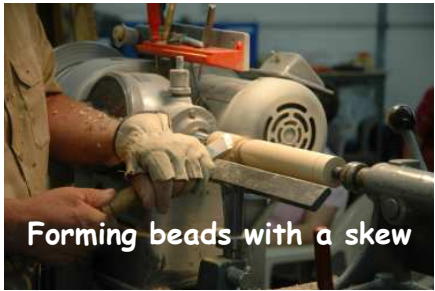
Forming beads with a skew