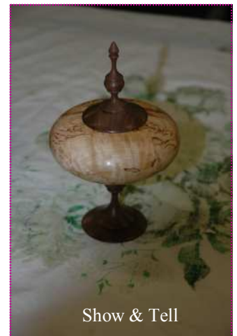
Show & Tell