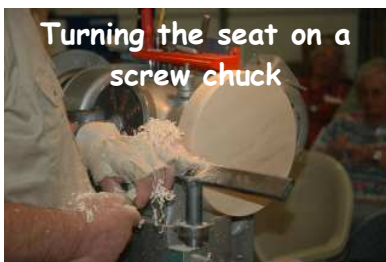
Turning the seat on a screw chuck