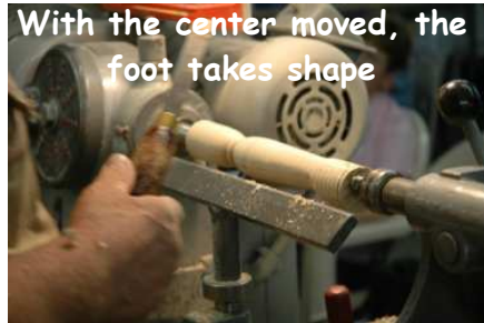
With the center moved, the foot takes shape