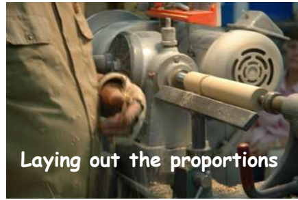
Laying out the proportions