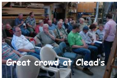
Great crowd at Clead's