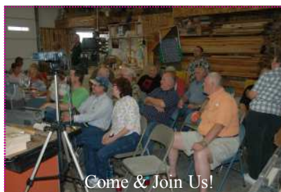
Come & Join Us!

Training Meeting 3 rd Thursday—7 pm Woodcraft Supplies 9891 S. 500 W.