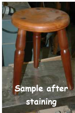
Sample after staining