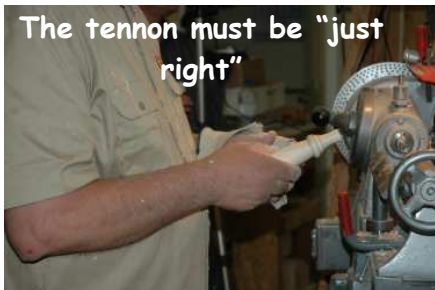
The tenon must be "just right"