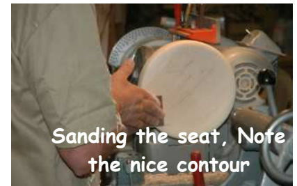
Sanding the seat, Note the nice contour