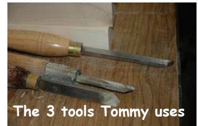
The 3 tools Tommy uses