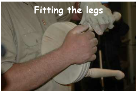
Fitting the legs