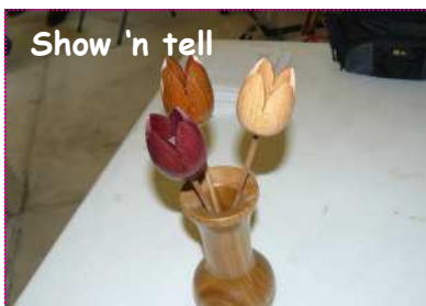
Show 'n tell

We kind of left Dave hanging for the turner's challenge for the month with the lidded vessels. Let's commit to do better!