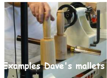
Examples Dave's mallets