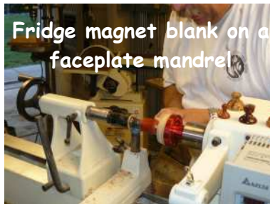
Fridge magnet blank on a faceplate mandrel