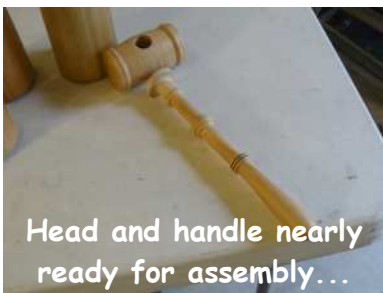
Head and handle nearly ready for assembly...