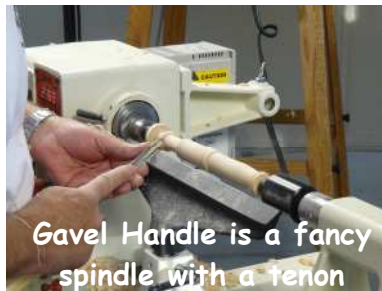
Gavel Handle is a fancy spindle with a tenon