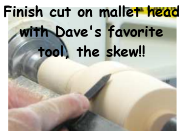
Finish cut on mallet head with Dave's favorite tool, the skew!!