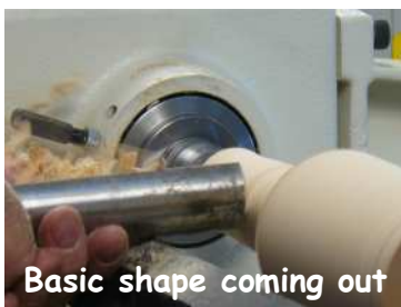
Basic shape coming out