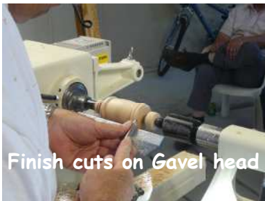
Finish cuts on Gavel head