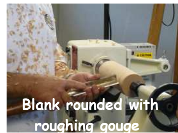
Blank rounded with roughing gouge