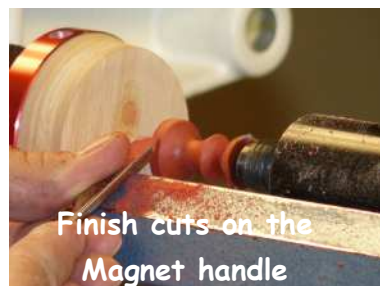
Finish cuts on the Magnet handle