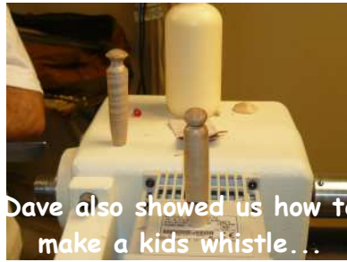
Dave also showed us how to make a kids whistle...