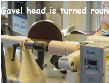
Gavel head is turned round