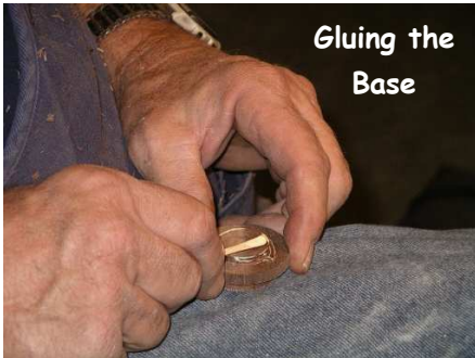
Gluing the Base