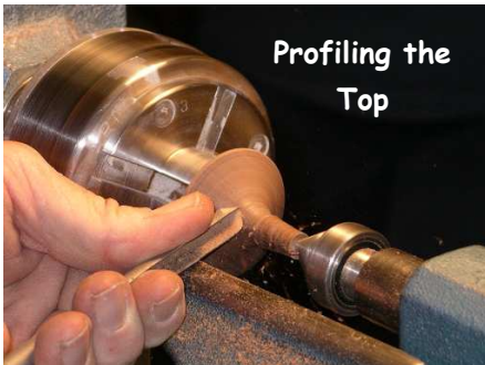
Profiling the Top