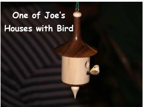
One of Joe's Houses with Bird

Bring a Potluck item and small turned item for the gift exchange