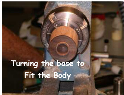
Turning the base to Fit the Body