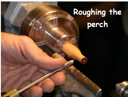
Roughing the perch