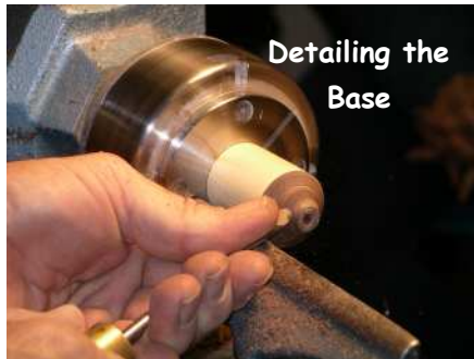
Detailing the Base