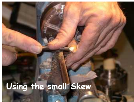
Using the small Skew