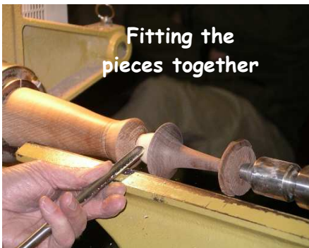
Fitting the pieces together