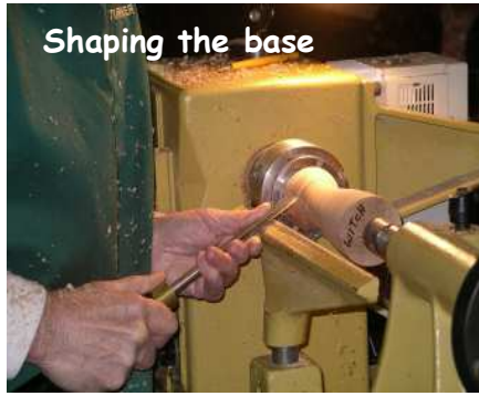
Shaping the base