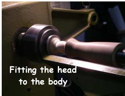
Fitting the head to the body