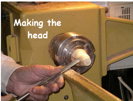
Making the head