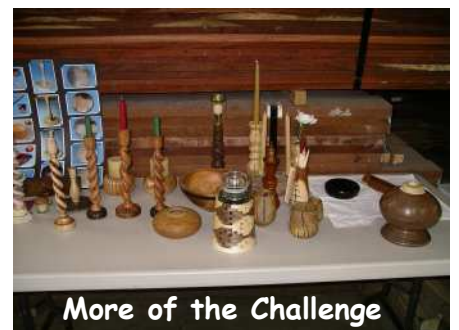
More of the Challenge