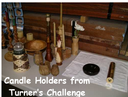
Candle Holders from Turner's Challenge