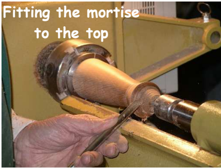
Fitting the mortise to the top