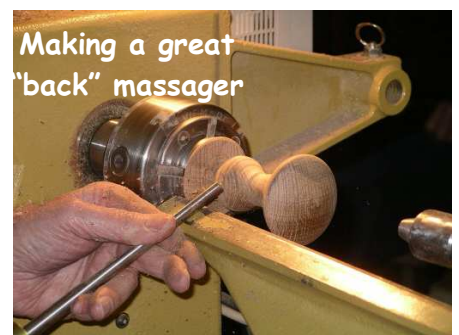
Making a great "back" massager