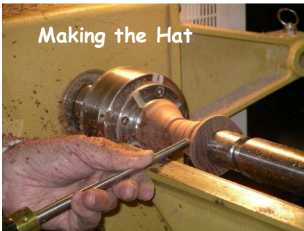
Making the Hat