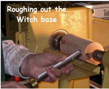
Roughing out the Witch base