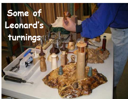
Some of Leonard's turnings

He also took a few minutes to show us how to make a small hand-held "back" and "body" massager. It is very simple to make and is amazingly effective. I would recommend everyone make and use one. Good job Leonard...and thanks !!