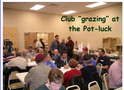
Club "grazing" at the Pot-luck