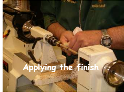
Applying the finish