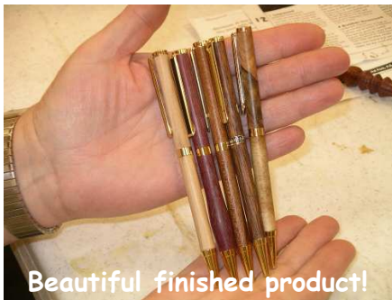
Beautiful finished product!