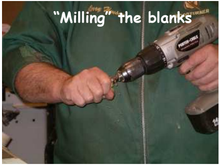
"Milling" the blanks