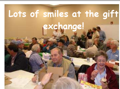
Lots of smiles at the gift exchange!