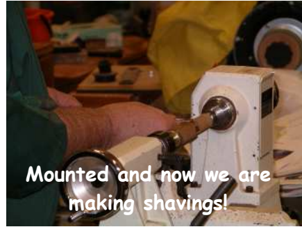
Mounted and now we are making shavings!