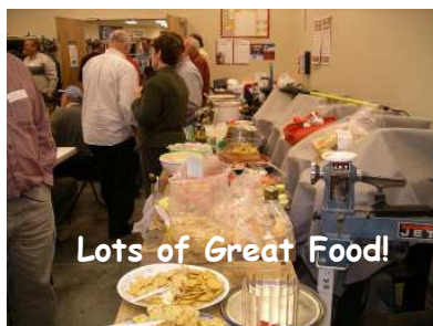
Lots of Great Food!