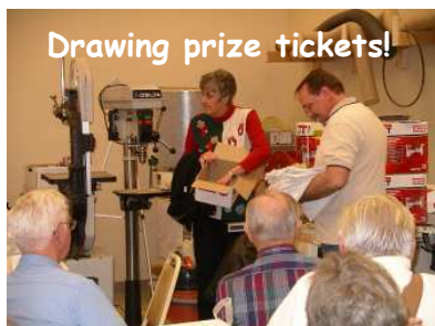
Drawing prize tickets!