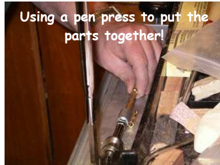
Using a pen press to put the parts together!