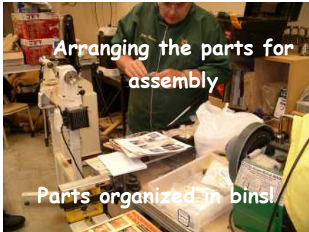
Arranging the parts for assembly