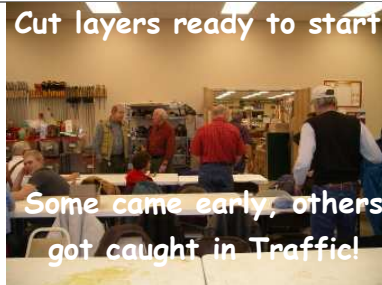
Cut layers ready to start Some came early, others got caught in Traffic!