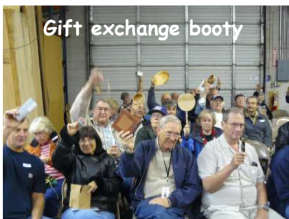
Gift exchange booty