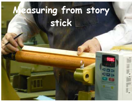
Measuring from story stick