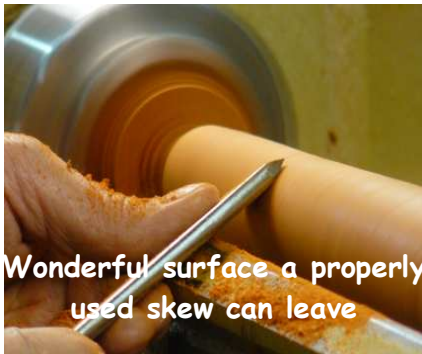
Wonderful surface a properly used skew can leave