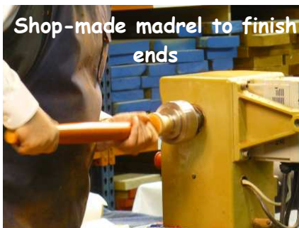
Shop-made madrel to finish ends