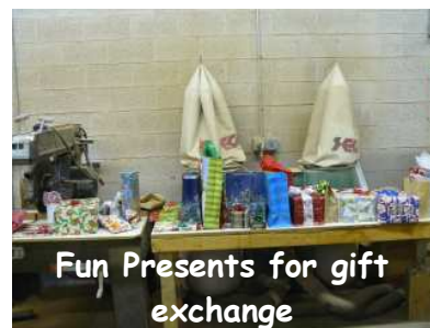
Fun Presents for gift exchange