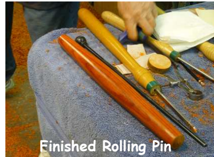
Finished Rolling Pin