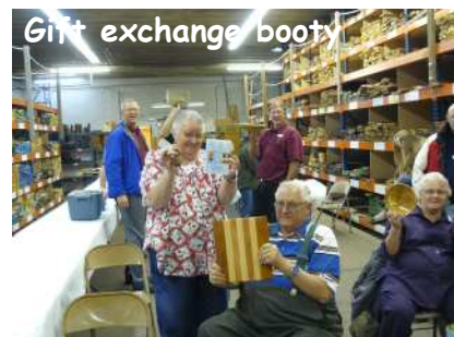
Gift exchange booty