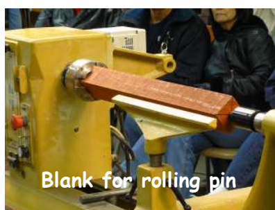
Blank for rolling pin