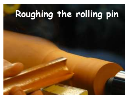
Roughing the rolling pin