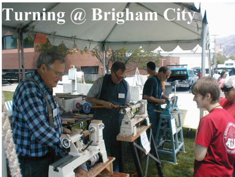
Turning @ Brigham City