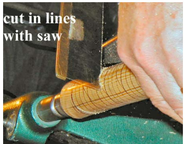
cut in lines with saw