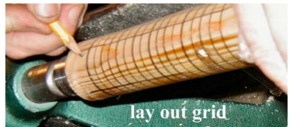
lay out grid