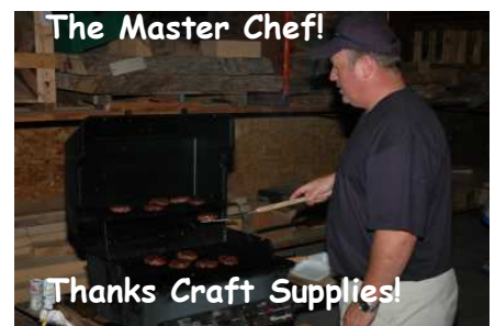
The Master Chef!