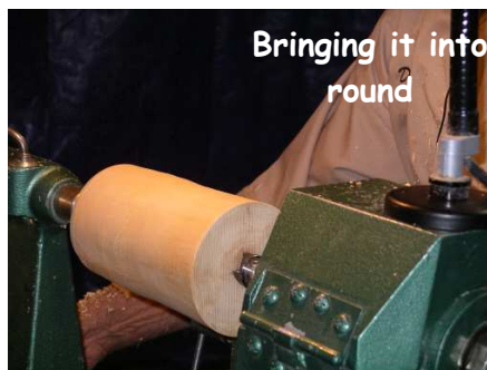
Bringing it into round