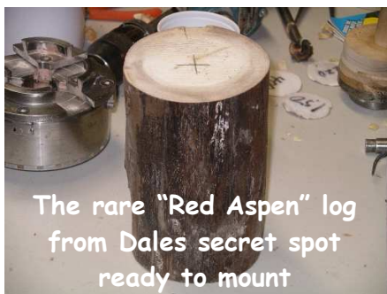
The rare "Red Aspen" log from Dales secret spot ready to mount