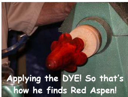
Applying the DYE! So that's how he finds Red Aspen!