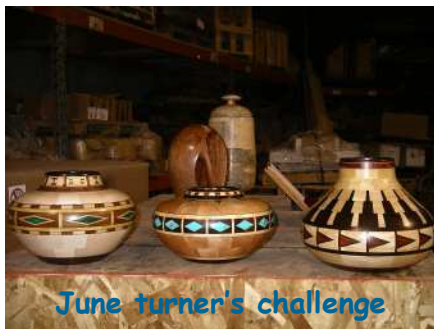
June turner's challenge