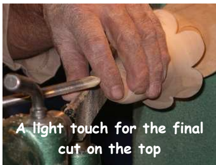
A light touch for the final cut on the top