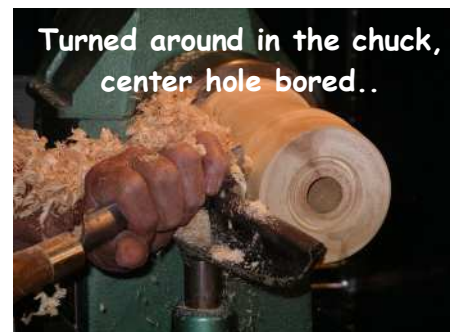
Turned around in the chuck, center hole bored..