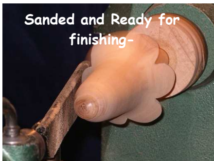
Sanded and Ready for finishing-