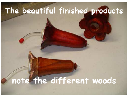
The beautiful finished products