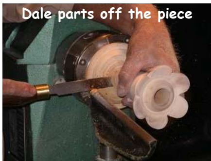
Detach parts off the piece