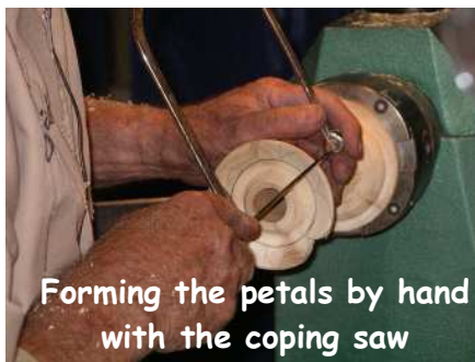
Forming the petals by hand with the coping saw