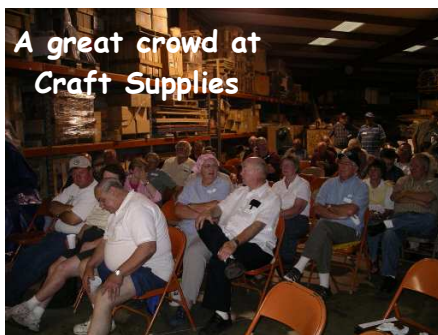
A great crowd at Craft Supplies