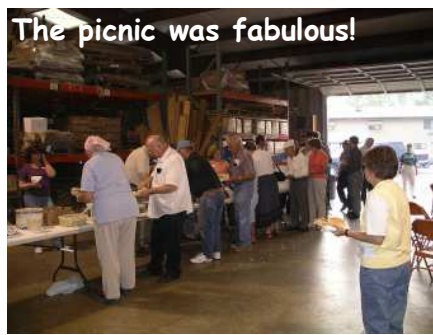
The picnic was fabulous!