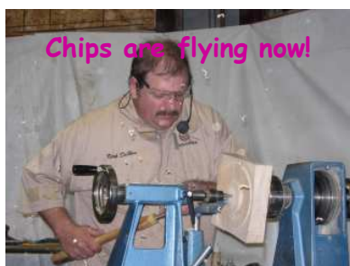
Chips are flying now!