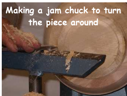
Making a jam chuck to turn the piece around