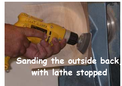
Sanding the outside back, with lathe stopped