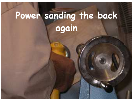
Power sanding the back again