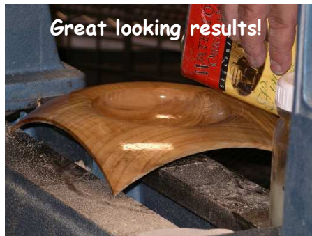
Great looking results!