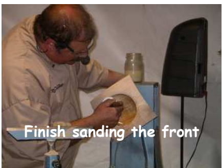
Finish sanding the front