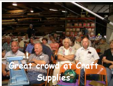
Great crowd at Craft Supplies