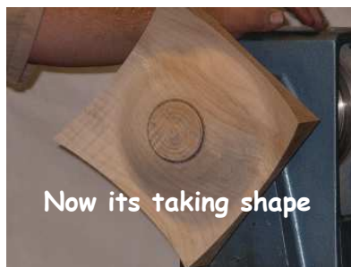
Now its taking shape