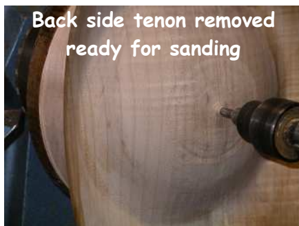
Back side tenon removed ready for sanding