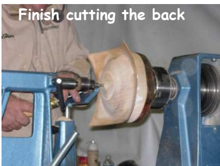
Finish cutting the back