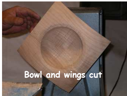
Bowl and wings cut