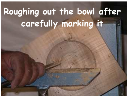
Roughing out the bowl after carefully marking it