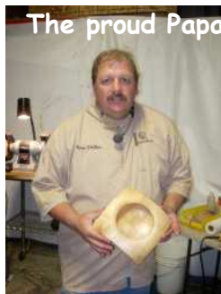
The proud Papa