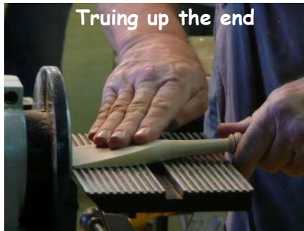
Truing up the end