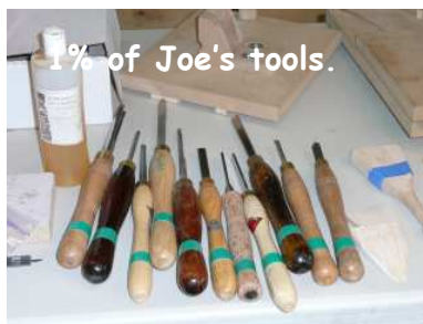
1% of Joe's tools.