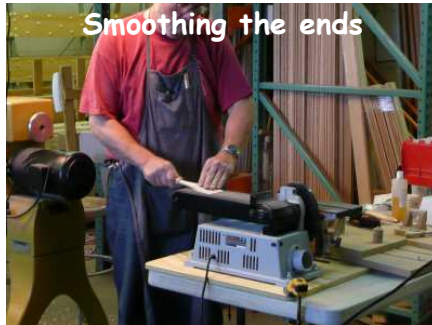
Smoothing the ends