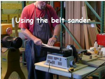
Using the belt sander