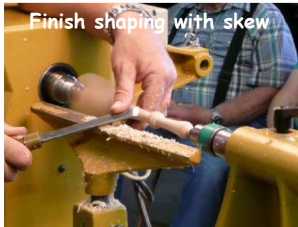
Finish shaping with skew