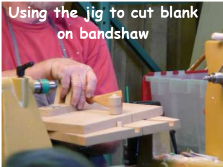
Using the jig to cut blank on bandsaw