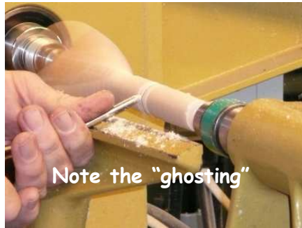
Note the "ghosting"