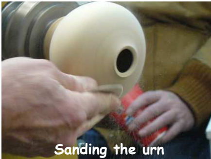
Sanding the urn