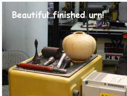
Beautiful finished urn!