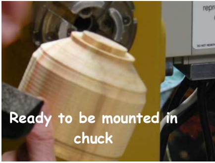
Ready to be mounted in chuck