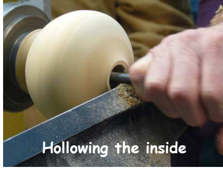
Hollowing the inside