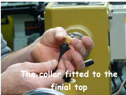
The collar fitted to the finial top