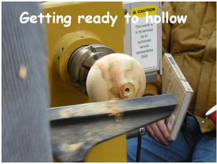
Getting ready to hollow