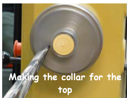
Making the collar for the top