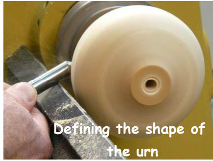
Defining the shape of the urn