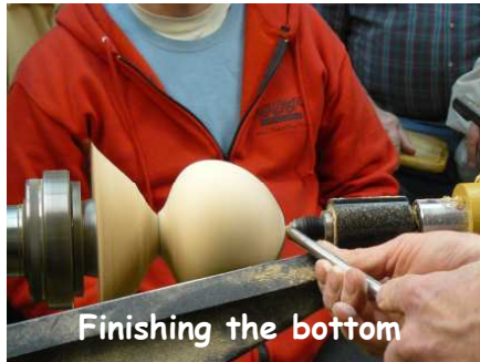
Finishing the bottom