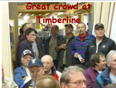
Great crowd at Timberline