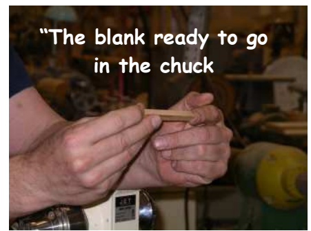
"The blank ready to go in the chuck