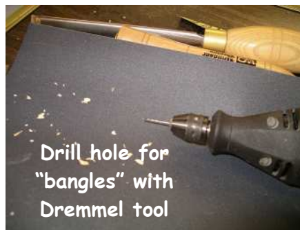
Drill hole for "bangles" with Dremmel tool