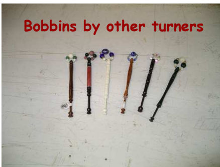
Bobbins by other turners