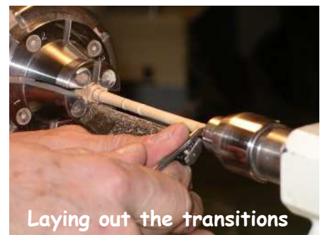
Laying out the transitions