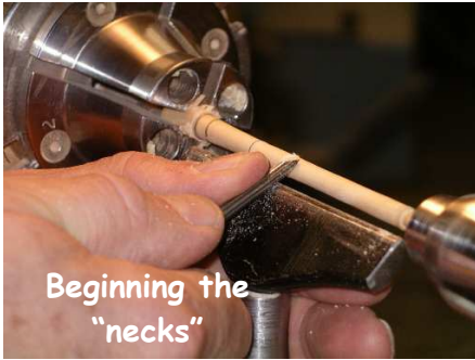
Beginning the "necks"