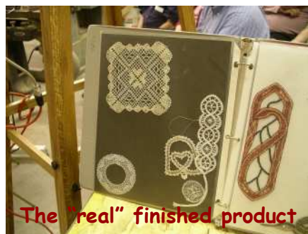
The "real" finished product