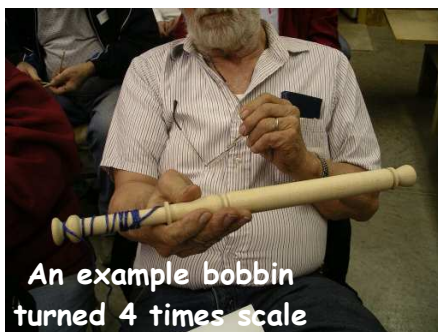
An example bobbin turned 4 times scale