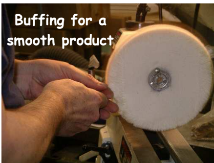
Buffing for a smooth product