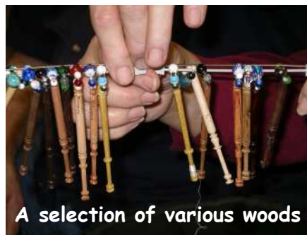
A selection of various woods