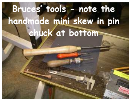
Bruces' tools - note the handmade mini skew in pin chuck at bottom