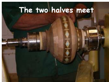
The two halves meet