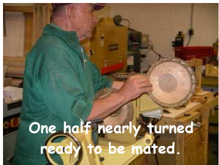
One half nearly turned ready to be mated.