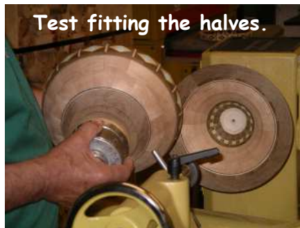
Test fitting the halves.