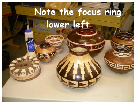
Note the focus ring lower left