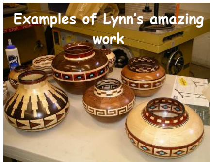
Examples of Lynn's amazing work