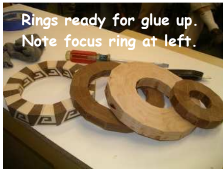
Rings ready for glue up. Note focus ring at left.