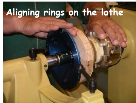
Aligning rings on the lathe