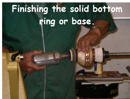
Finishing the solid bottom ring or base.