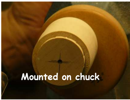
Mounted on chuck