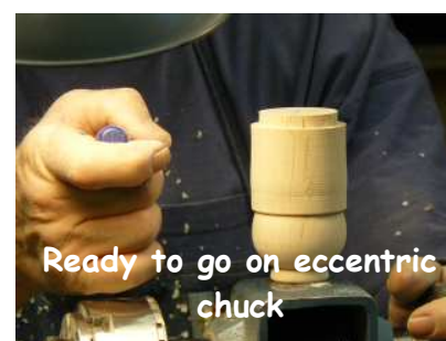
Ready to go on eccentric chuck