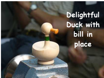
Delightful Duck with bill in place