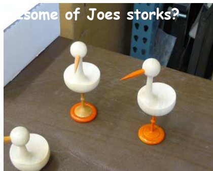
Some of Joes storks?