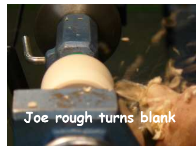
Joe rough turns blank