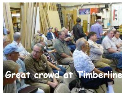
Great crowd at Timberline