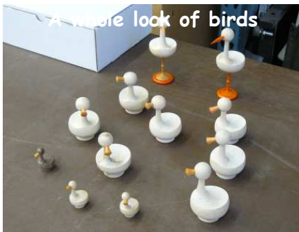
A whole lot of birds