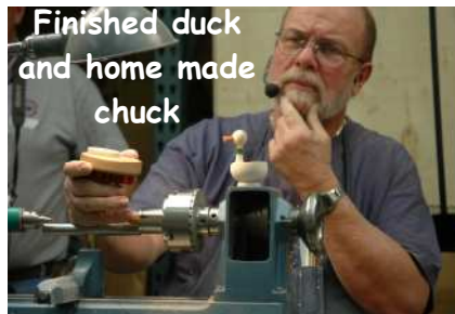
Finished duck and home made chuck