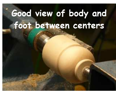
Good view of body and foot between centers