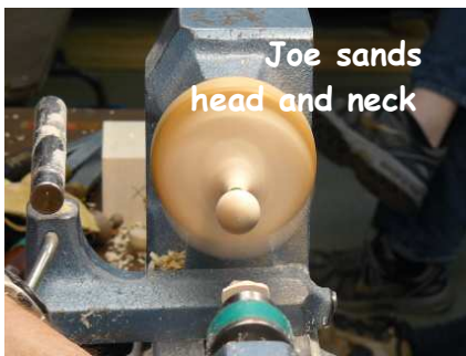
Joe sands head and neck