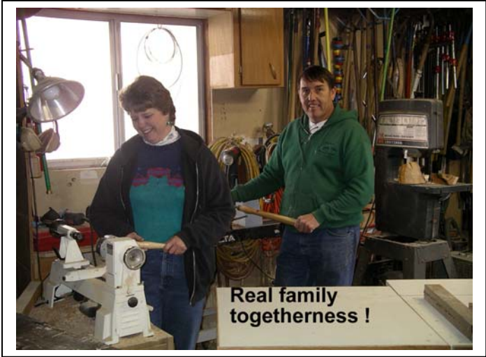
Real family togetherness !