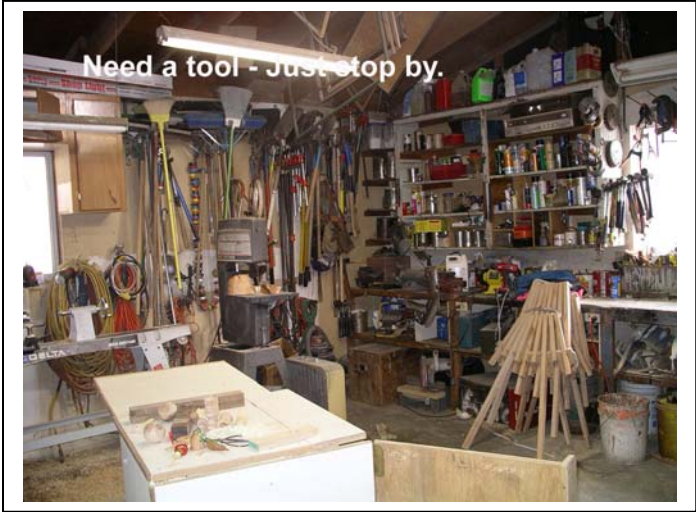
Need a tool - Just stop by.