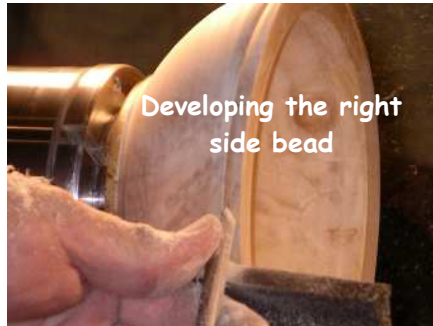
Developing the right side bead