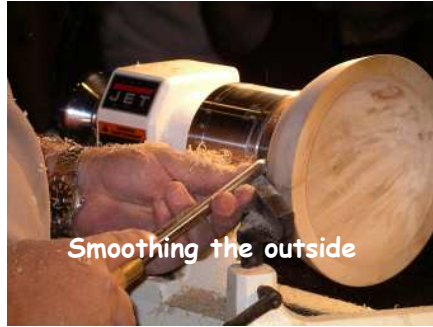
Smoothing the outside