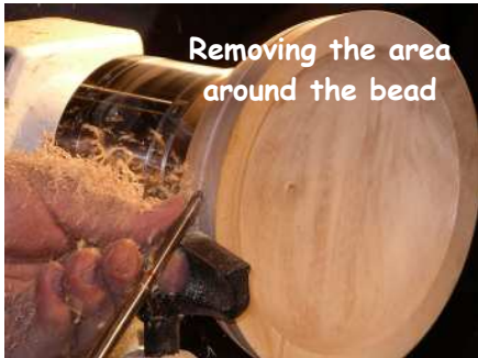
Removing the area around the bead