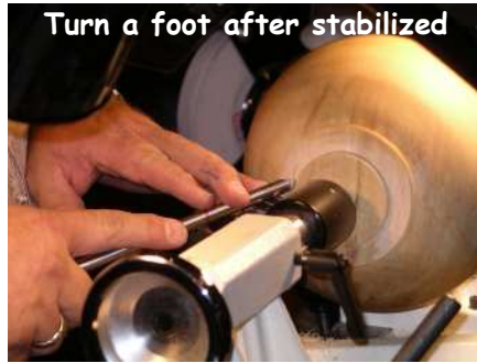
Turn a foot after stabilized