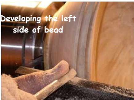
Developing the left side of bead