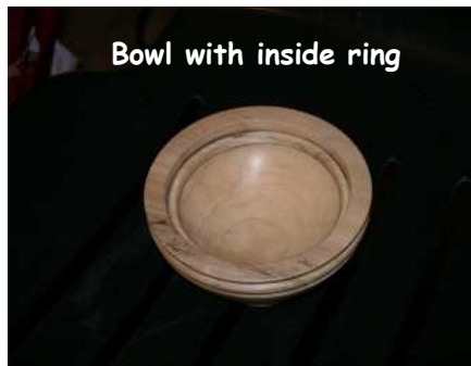
Bowl with inside ring