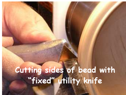
Cutting sides of bead with "fixed" utility knife