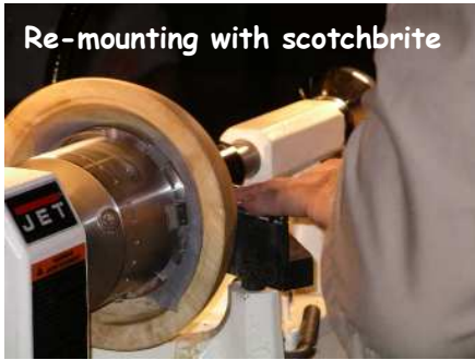
Re-mounting with scotchbrite