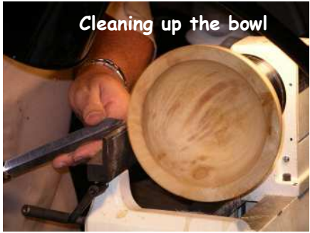
Cleaning up the bowl