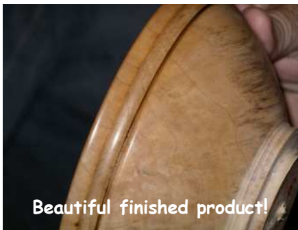
Beautiful finished product!